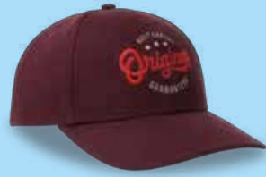
STYLE 1001 6 PANEL CAP