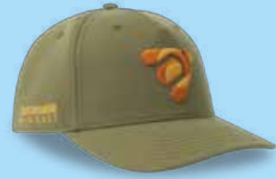
STYLE 1002 5 PANEL CAP