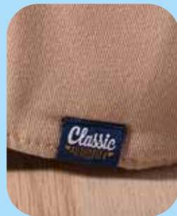
WOVEN FOLDABLE LABEL