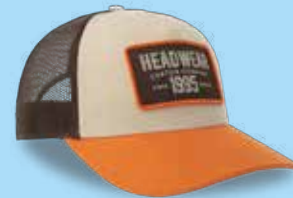
STYLE 1003 TRUCKER CAP