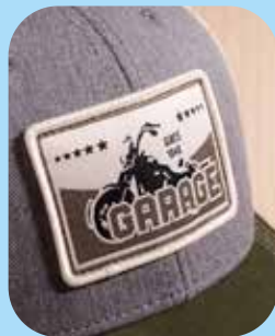
WOVEN PATCH WITH OVERLOCK OUTLINE